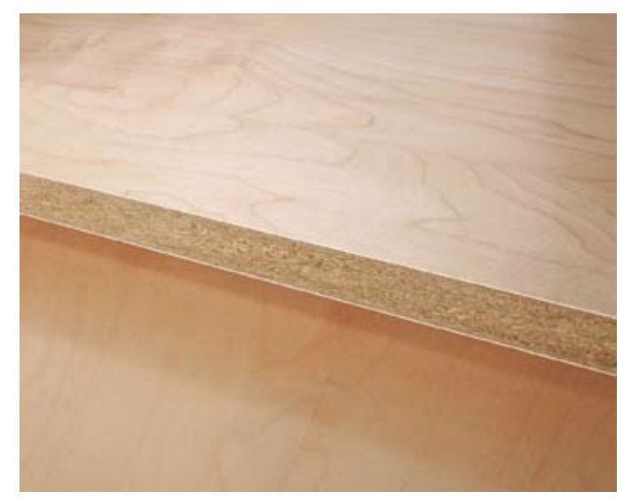
Columbia Forest Products and BuildingGreen.com

Other alternative adhesives are available to manufacture particle board and fiber board with ultra low formaldehyde emissions.<sup>88</sup> In addition, everyday building materials—such as stone, brick, metal, glass,